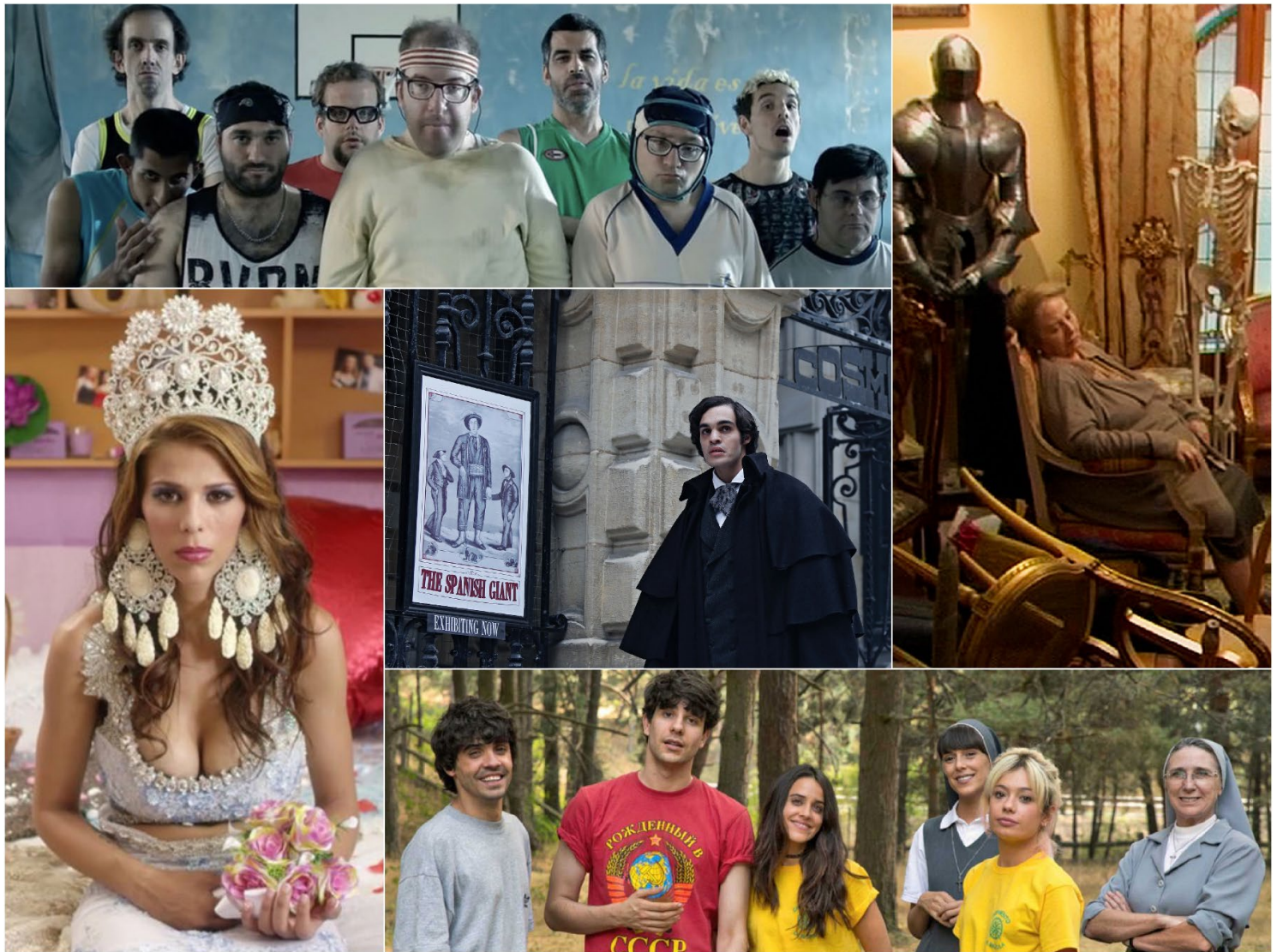
The 2018 vintage: (clockwork from top left): Champions ; Lots of Kids, a Monkey and a Castle ; Holy Camp ; Carmen & Lola ; The Giant .